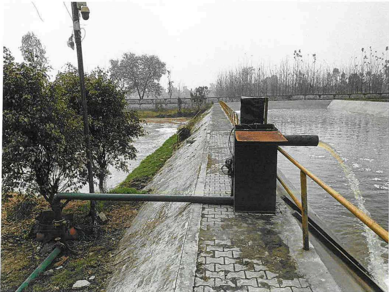
OCEMS sensor have been reinstalled in ETP Outlet Channel