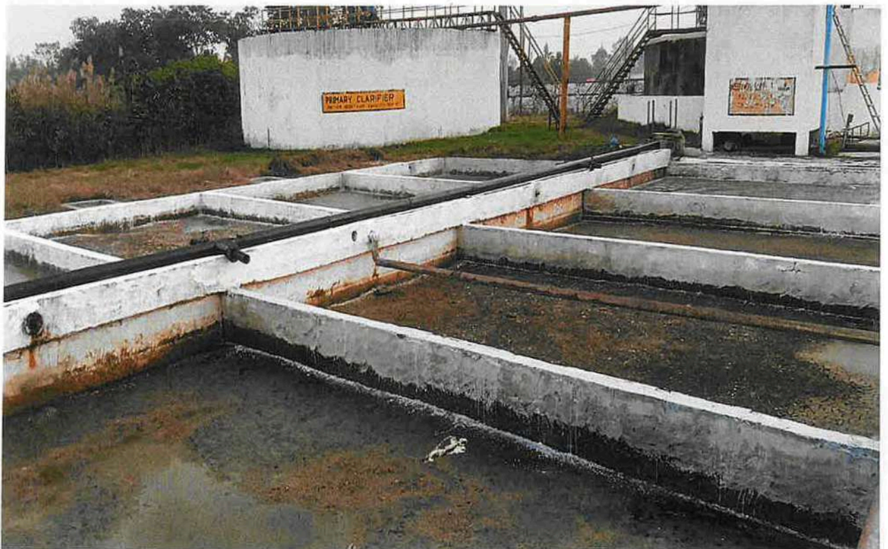
Sludge Drying Bed