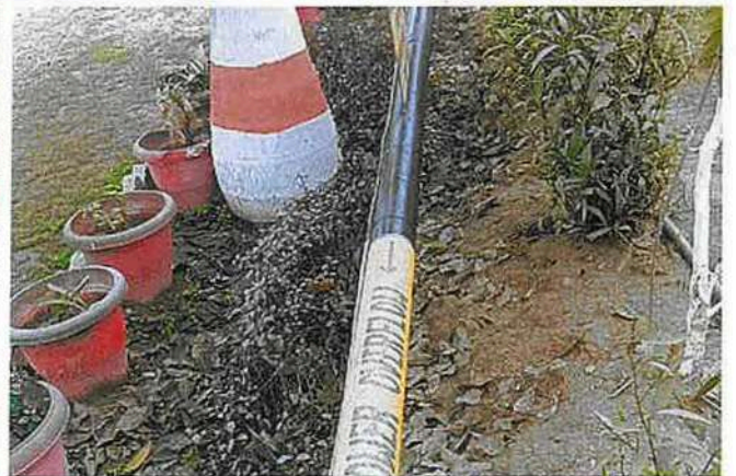
Untreated Effluent Line