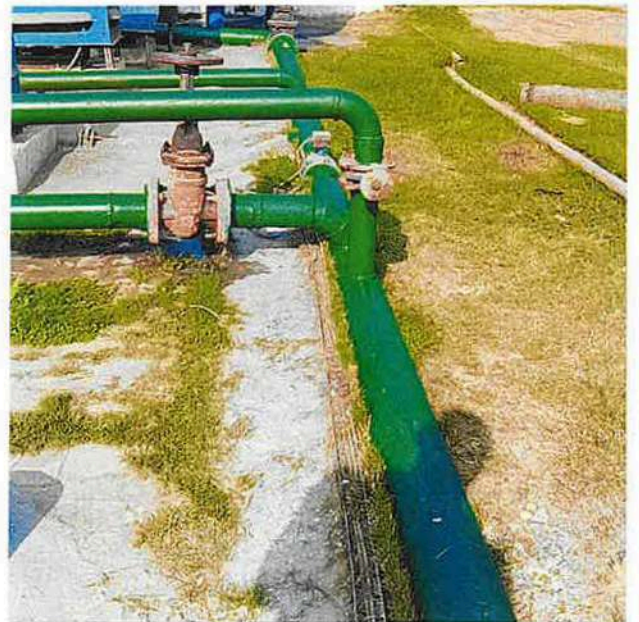
Treated Effluent Line